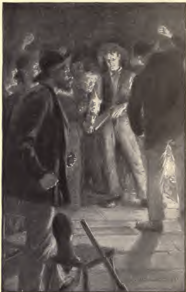
The scratch of the point on the hard steel.